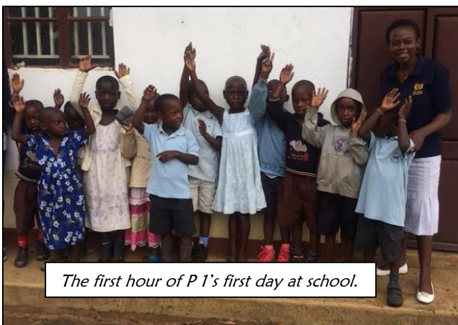
The first hour of P 1's first day at school.