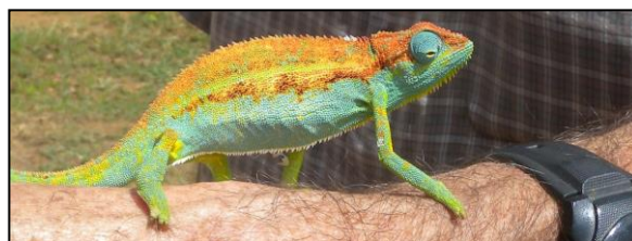
'Karmakarmachameleon' ... a new friend found in the school garden.